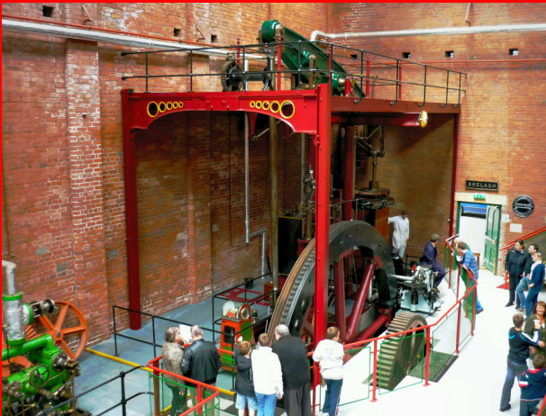
McNaughted compound beam engine from a mill in Marsden, near Huddersfield

Our larger engines include a giant 40-ton "McNaughted" beam engine, a very rare 1840 twin-beam engine and a unique "non-dead-centre" vertical engine built by Musgraves of Bolton. A number of other engines are also on display, including a small engine "Caroline" that used to drive Fred Dibnah's workshop. All of them can be seen in motion on regular steam days.