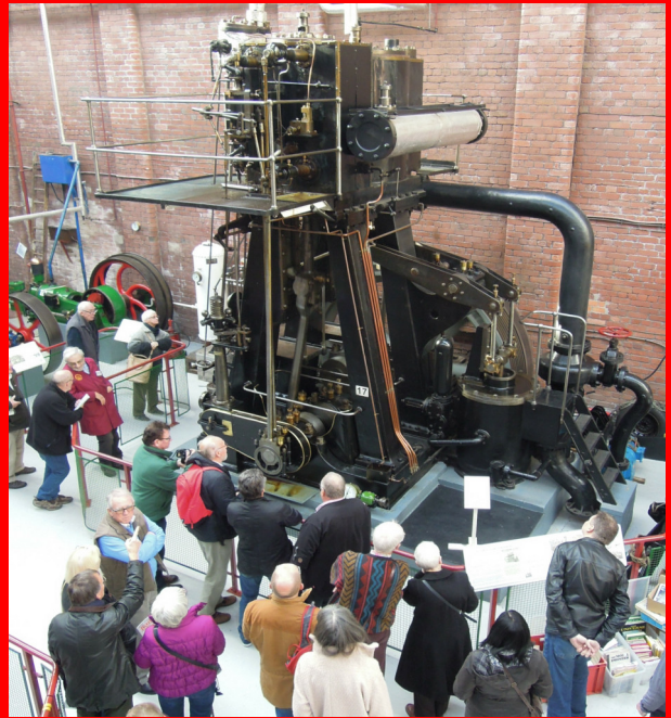
An inverted vertical engine from the "Diamond Ropeworks" at Royton, nr Oldham

There is free parking on the Supermarket car-park and a small second-hand book shop and refreshment stall operate on steam days. Admission is free but donations are appreciated to help meet the cost of raising steam in the boiler. The museum is disabled-accessible with level floors, lift and toilets.