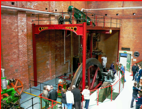
McNaught compound beam engine from a mill in Marsden, near Huddersfield

Our larger engines include a giant 40-ton "McNaughted" beam engine, a very rare 1840 twin-beam engine and a unique "non-dead-centre" vertical engine built by Musgraves of Bolton. A number of other engines are also on display, including a small engine "Caroline" that used to drive Fred Dibnah's workshop. All of them can be seen in motion on regular steam days.