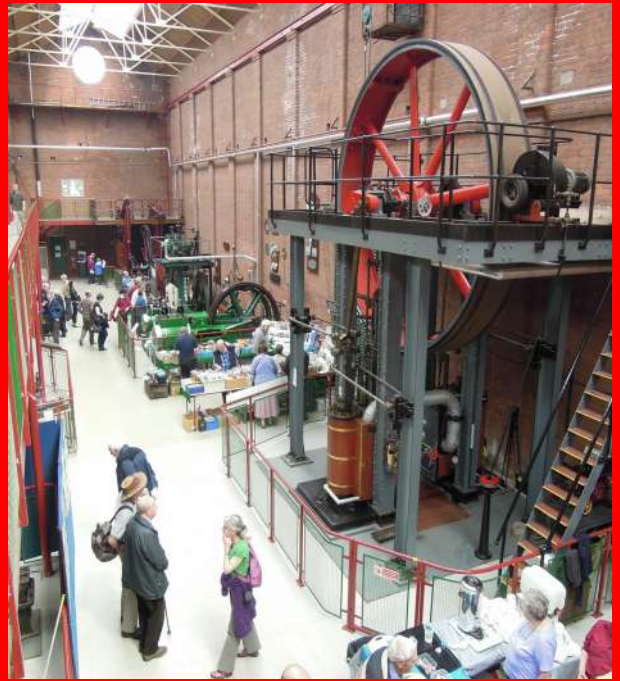
A unique true vertical cross-compound engine, rescued from a mill in Denby Dale

There is free parking on the Supermarket car-park and a small shop and refreshment stall operate on steam days. Admission is free but donations are appreciated to help meet the cost of raising steam in the boiler. The museum is disabled-accessible with level floors, lift and toilets.