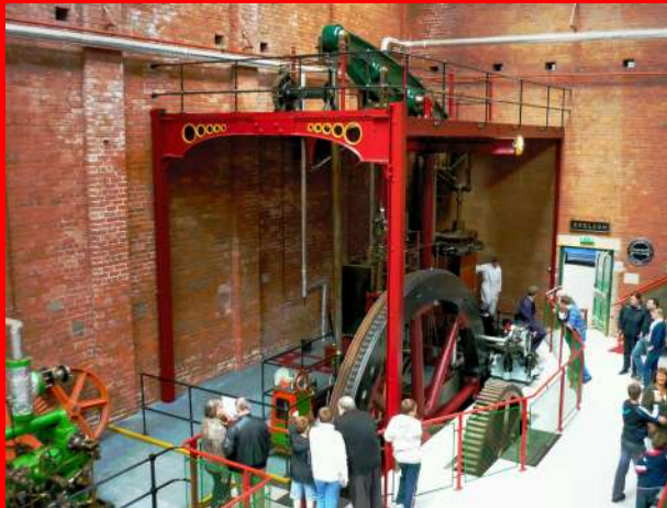
McNaught compound beam engine from a mill in Marsden, near Huddersfield

Our larger engines include a giant 40-ton "McNaughted" beam engine, a very rare 1840 twin-beam engine and a unique "non-dead-centre" vertical engine built by Musgraves of Bolton. A number of other engines are also on display, including a small engine "Caroline" that used to drive Fred Dibnah's workshop. All of them can be seen in motion on regular steam days.